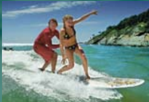
ripping' in no time