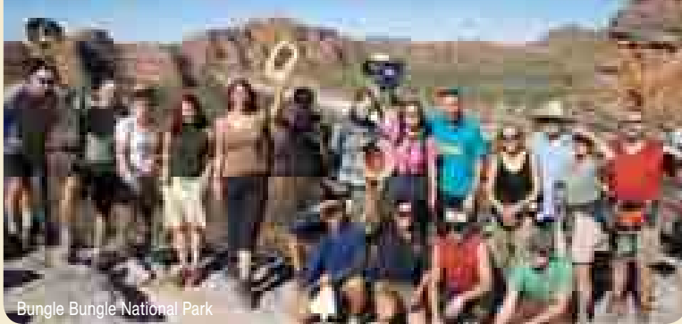
Bungle Bungle National Park