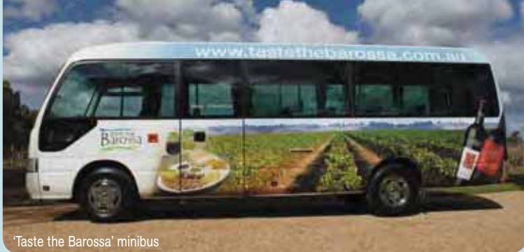
'Taste the Barossa' minibus