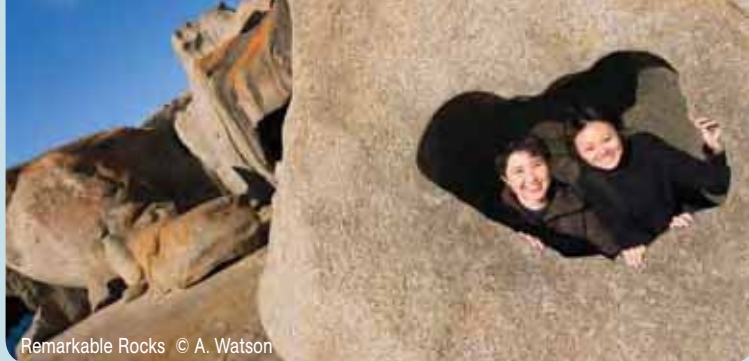
Remarkable Rocks