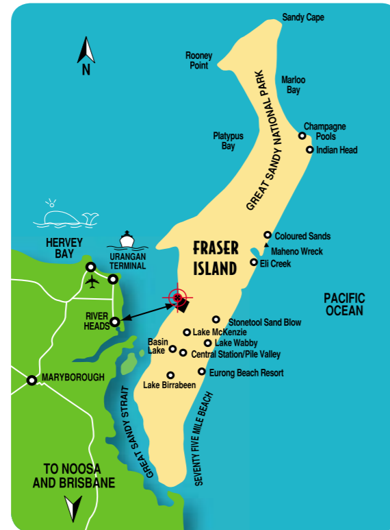
Map of Fraser Island depicting major tourist attractions and departure point from River Heads.