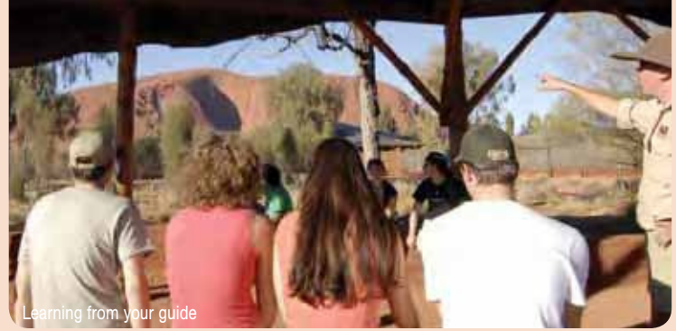
Learning from your guide