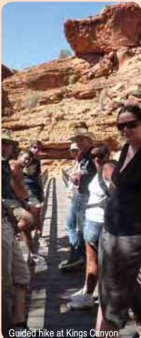
Guided hike at Kings Canyon