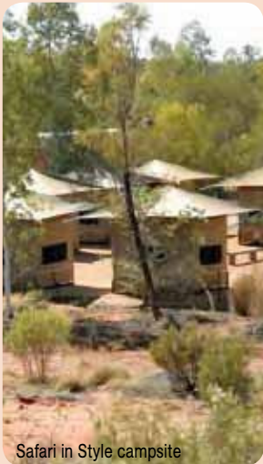
Safari in Style campsite