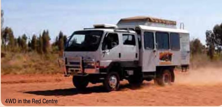
4WD in the Red Centre