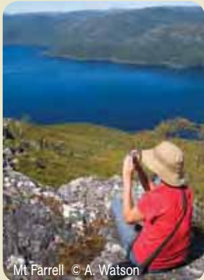
Mt Farrell