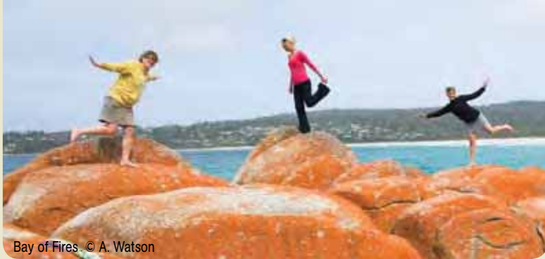
Bay of Fires