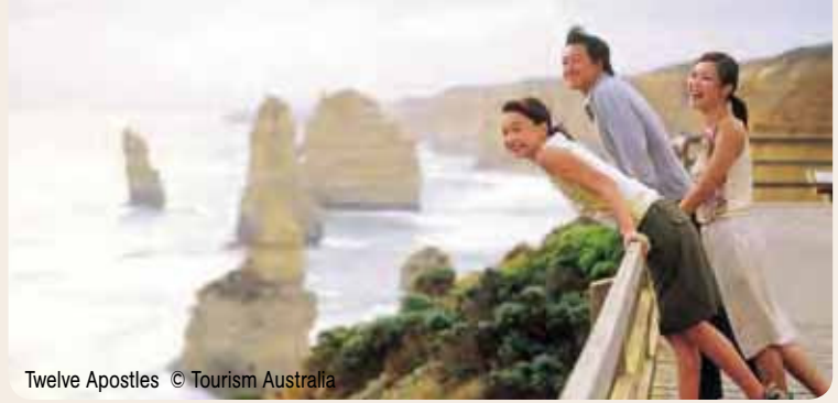
Twelve Apostles