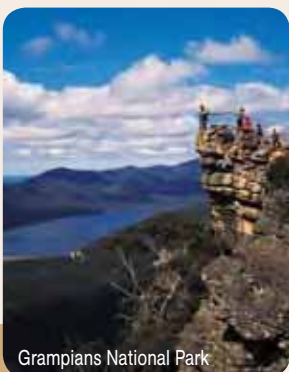
Grampians National Park

Safaris must be reconfirmed 48 hours prior to travel. Itineraries may vary and/or attractions be substituted due to seasonal & extreme weather conditions, Traditional Owner and national park requirements. Luggage limit of 15 kg applies (10 kg on Kakadu Safaris) – in a backpack or soft bag. Please refer to our terms and conditions at the back of the brochure.