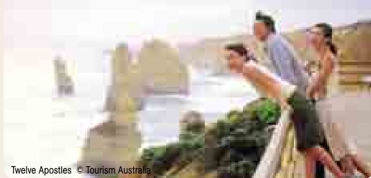
Twelve Apostles