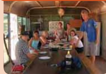
Screened eating areas