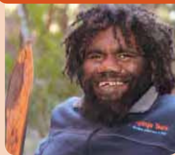
Your Aboriginal guide will be accompanied by an interpreter.

INCLUDES AN ABORIGINAL GUIDED MALA WALK ^ VALUED AT $69!