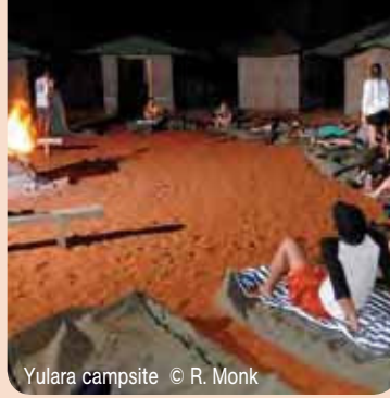
Yulara campsite