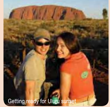
Getting ready for Uluru sunset