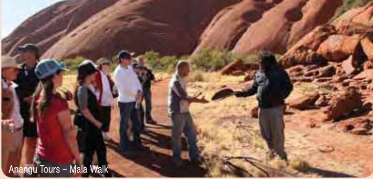
Anangu Tours – Mala Walk