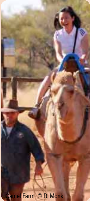
Camel Farm