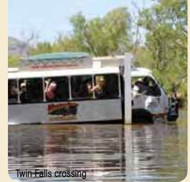
Twin Falls crossing