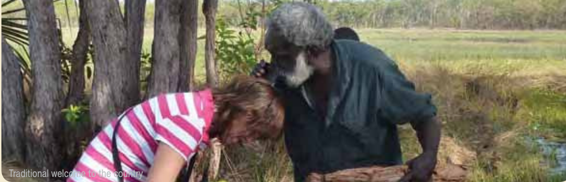
Traditional welcome to the country