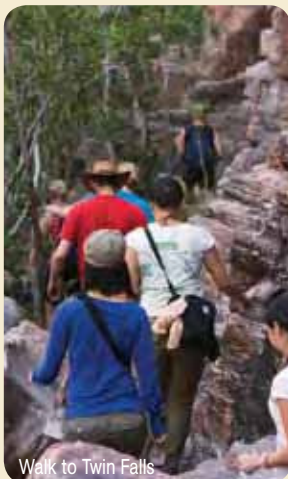
Walk to Twin Falls