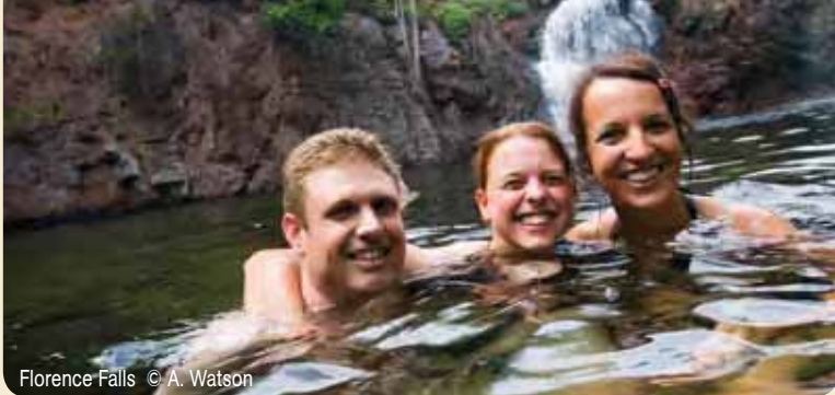
Florence Falls