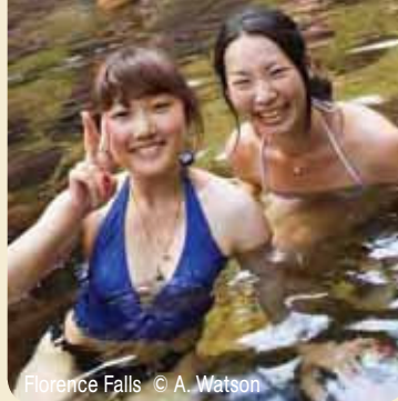
Florence Falls