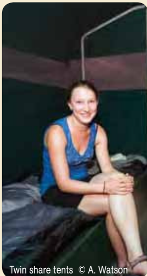
Twin share tents