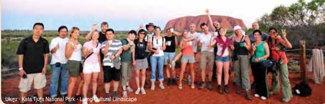
Uluru - Kata Tjuta National Park - Living Cultural Landscape