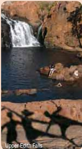
Upper Edith Falls