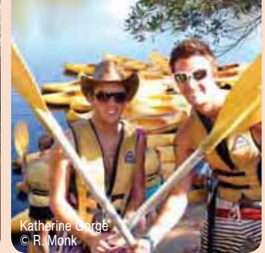
Katherine Gorge