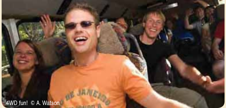
4WD fun!