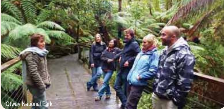
Otway National Park