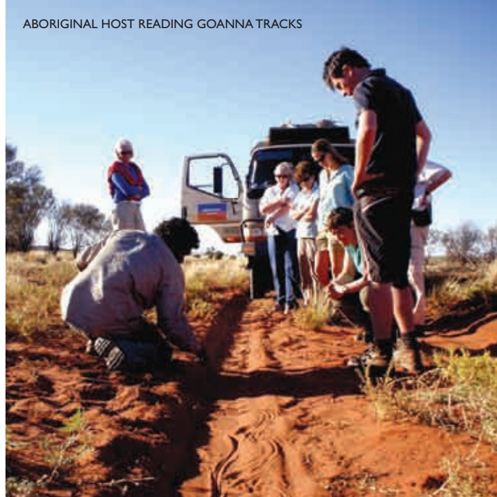
ABORIGINAL HOST READING GOANNA TRACKS