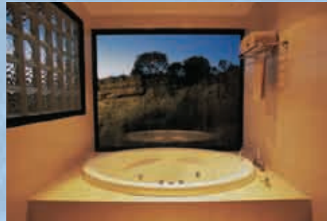
DELUX SPA ROOM KINGS CANYON RESORT