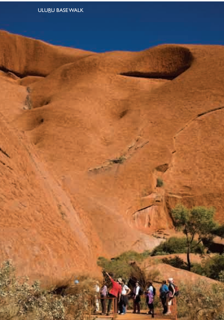
ULURU BASE WALK

+ Optional extras additional to Wayoutback fare - Kuniya Walk, Camel Ride, Sleeping Bags.