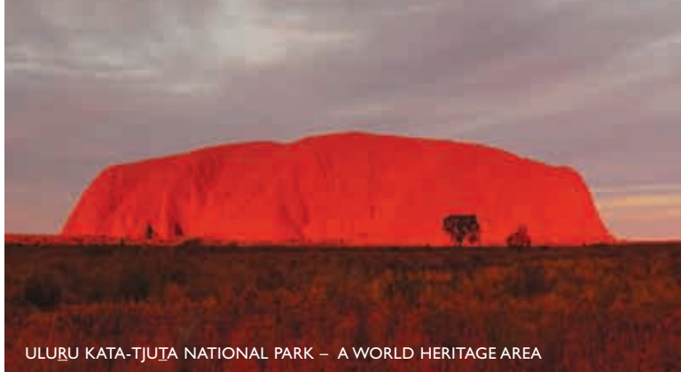
ULURU KATA-TJUTA NATIONAL PARK – A WORLD HERITAGE AREA