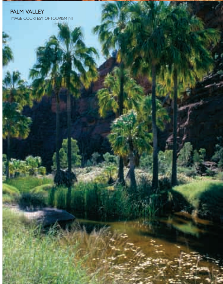
PALM VALLEY IMAGE COURTESY OF TOURISM NT