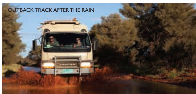
OUTBACK TRACK AFTER THE RAIN