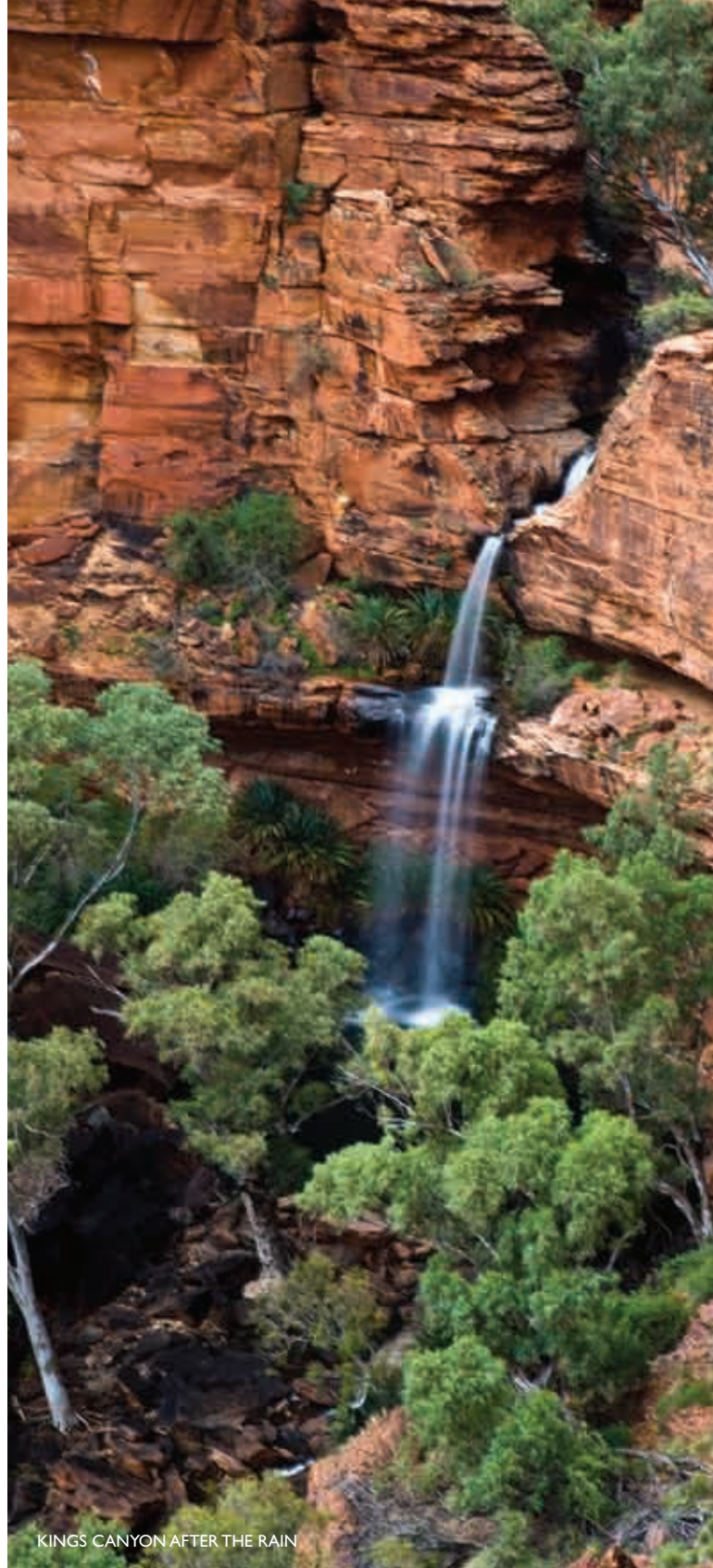
KINGS CANYON AFTER THE RAIN