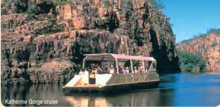
Katherine Gorge cruise