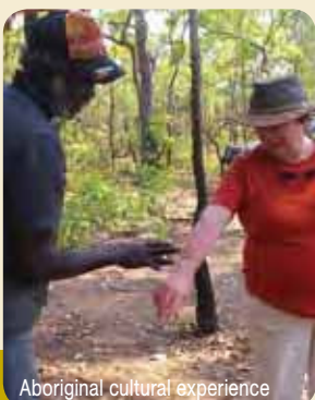
Aboriginal cultural experience

Safaris must be reconfirmed 48 hours prior to travel. Itineraries may vary and/or attractions be substituted due to seasonal & extreme weather conditions, Traditional Owner and national park requirements. Luggage limit of 15 kg applies (10 kg on Kakadu Safaris) - in a backpack or soft bag. Please refer to our terms and conditions at the back of the brochure.